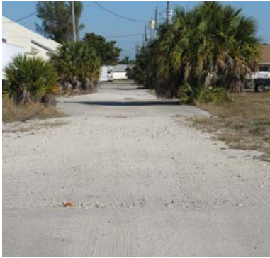
Area 4 – Partially Paved Alley

Area #4 is bound to the south by the Malaga Canal and to the north by SE 43 rd Street. Orchid Boulevard serves as the eastern boundary. Because of its position around the northernmost portion of the existing CRA, Area 4 has two distinct western boundaries: the partially paved alleyway west of Orchid Boulevard (the existing CRA boundary) in the southern part of the expansion area and the two large parcels to the west of Del Prado Boulevard in the northern section. This section of the study area consists of a mix of commercial properties, single family residences, and multifamily residential. The area could potentially include a significant commercial development. The area encompasses approximately 20 acres.