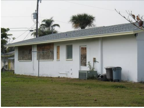
Area 6 – Residential Deterioration

Area #6 is located south of Cape Coral Parkway. The northern boundary is the Norfolk Canal. The western boundary is Waikiki Avenue and the southern and eastern boundary is the Caloosahatchee River. The area is a mix of single family and multifamily parcels. The area encompasses approximately 65 acres.