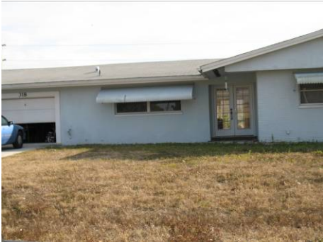
Area 8 – Residential

Area #8 is located just west of the existing CRA. The southern boundary is Cape Coral Parkway. The northern boundary is SE 47 th Terrace. It is bound to the west by SE 2 nd Court and to the east by Palm Tree Boulevard. The area consists of single family, multifamily, and commercial properties. The area is significant as an expansion to the CRA, because it serves as part of the western gateway to the existing community redevelopment area. Half of the area fronts Cape Coral Parkway. The area encompasses approximately 7 acres.