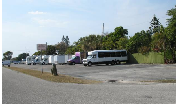
Area 4 – Underutilized Commercial Land

The key element, besides the infrastructure upgrades, is the opportunity to support commercial development on underutilized commercial sites.