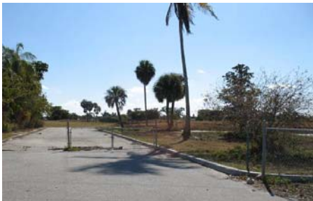
Area 12 – Golf Course

Area #12 is the northern-most section of the CRA expansion study area and consists of mainly single family homes and multifamily properties, including a number of condominiums. The 175 acre former Cape Coral Golf Club is no longer in operation and the clubhouse and related facilities have been razed. It now sits in the center of this area. In its current state of deterioration, the golf course has become a major source of concern for the community, the City, and adjacent property owners. To the south, Area 12 is bound by Areas 8 and 9 as well as one block of Cape Coral Parkway between SE 2 nd Court and the San Carlos Canal. The San Carlos Canal and Basin border the area to the west while the Santa Fe Canal defines the northern boundary. Area 12 is bound to the east by the Rubican Canal and a portion of Palm Tree Boulevard. The area encompasses approximately 1,180 acres.