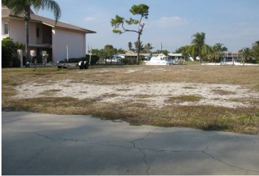
Area 5 – Vacant Land, No Curbs/Gutters

Area #5 is located just north of Cape Coral Parkway and the existing CRA boundary. The southern portion of Area 5 includes two parcels that were considered for inclusion in the 2003 expansion of the CRA. The parcels are important for consistency along Cape Coral Parkway and are located just west of the Chamber of Commerce. The area is bound to the north by the Malaga Canal and to the northeast by the curving Mandolin Canal. The existing CRA defines the area's western boundary. The area mostly consists of multifamily residences. The area encompasses approximately 22 acres.