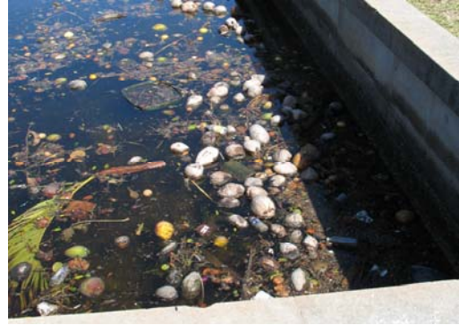
Area 9 – Polluted Canal

Infrastructure enhancements and upgrades to the residential products in the area are essential to long term viability. Environmental improvements to eliminate degradation of canal pollution should be a priority.