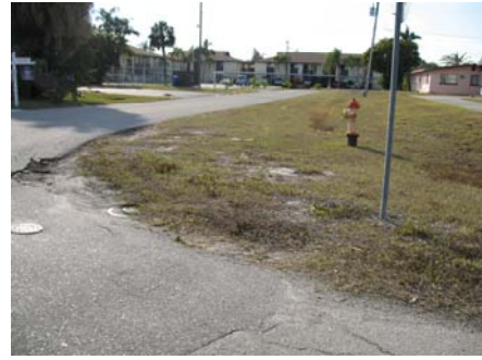
Area 7 – Infrastructure

This area has significant potential for both commercial mixed use redevelopment opportunities as well as creating a sense of place for the community through well designed access corridors to the water. Infrastructure and open space features are key to sustainability.