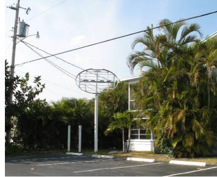
Area 5 – Motel

Key elements in this area include infrastructure upgrades and support of sustainable multi family product.