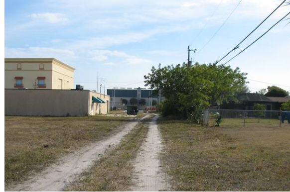
Area 10 – Alley

This small area needs to be included in infrastructure upgrades, particularly storm water and alleyway improvements.