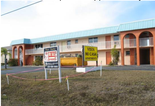
Area 3 – Apartment Complex

Area #3 is bound to the south by SE 46 th Lane, to the north by the Malaga Canal, to the east by the second parcel west of Del Prado Boulevard, and to the west by Coronado Parkway. Currently, the southern portion of SE 46 th Lane is included in the CRA, but the right-of-way to the north is not included. This has prohibited the CRA from investing in infrastructure and streetscape improvements on the northern side of the road. Area 3 includes many multifamily properties along the canal, some of which are deteriorating. The area encompasses approximately 20 acres.