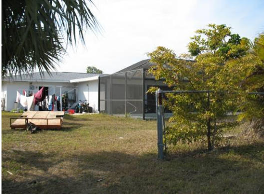
Area 10 – Residential

Area #10 consists of single family properties. The area is just west of the existing CRA boundary. The area is bound by SE 46 th Street to the south, SE 44 th Street to the north, SE 14 th Place to the west, and to the east, the alley between the properties lining SE 14 th Place and SE 15 th Ave. Some of the properties are deteriorating, and the alley is in substandard condition. The area encompasses approximately 6 acres.