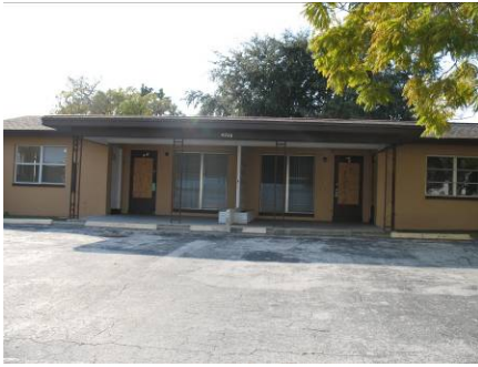
Area 7 – Residential Deterioration

Area #7 is bound to the north by Miramar Street and to the west by Coronado Parkway. To the south, most of the area is bound by the Bimini Canal, but the eastern-most portion is bound by the Vendome Canal, which runs to Cape Coral Street. The eastern boundary is the Vincennes Canal. Most of the area consists of multifamily residential properties. A substantial number of the multifamily structures in Area 7 are deteriorating. The area encompasses approximately 87 acres.