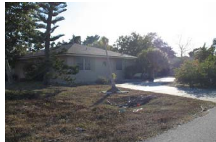
Area 12 – Residential

The key objective for this area is the acquisition of the golf course, its redevelopment back to a viable course, the opportunity to include certain complementary commercial and recreational uses, the use of the open space to support storm water system and/or other environmental projects, as well as programs that support the residential sustainability of the surrounding neighborhoods.