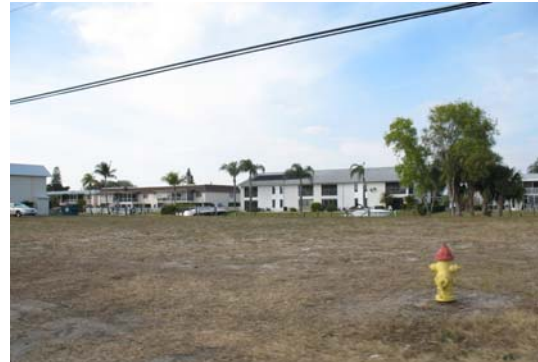
Area 3 – Vacant Lot

The key elements to be addressed in this area are the upgrades of infrastructure, storm water, sidewalks, curbs and gutters and the creation of opportunities for redevelopment on underutilized real estate.