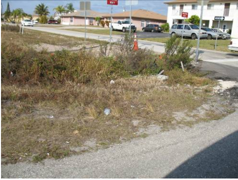
Area 9 – Neglected Infrastructure

Area #9 is bound by SE 47 th Terrace to the south, Palm Tree Boulevard to the west, Coronado Parkway to the east, and SE 46 th Street to the north. The area mainly consists of single family and multifamily properties. The area also includes the Rubican Canal, a polluted waterway that exhibits poor storm water conditions in the area. The area encompasses approximately 56 acres.