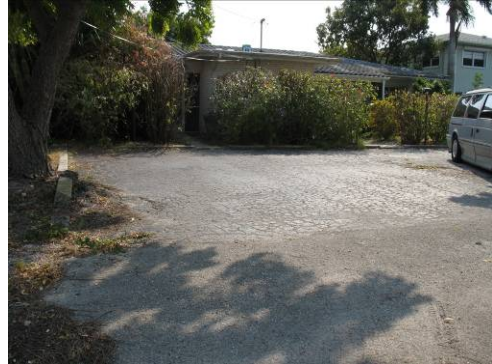
Area 6 – Excessive Pavement

This area has the potential for significant mixed use redevelopment due to its current mix of uses and access to the water. Infrastructure upgrades are also needed for long term sustainability.