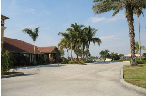
Area 11 – Chamber of Commerce

Area #11 is the most eastern section of the study area and meets criteria, but is not included as part of the amended plan because it is outside of the corporate limits of the City of Cape Coral. It consists of the right-of-way east of the Chamber of Commerce site on Cape Coral Parkway. The area is important to the establishment of an eastern gateway to the city and forms the initial impression of downtown Cape Coral. The area is in need of redevelopment in order to create a sense of place and nurture commercial development downtown. The area encompasses approximately 14 acres.