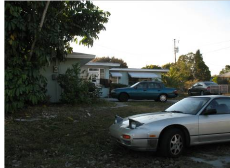
Area 8 – Residential

This small area has the opportunity to serve as the western entry icon for the downtown. The residential character of the area not fronting Cape Coral Parkway should continue to be supported through street, sidewalks, and related infrastructure improvements.