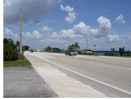
Area 11 – Gateway

This area should serve as the eastern entrance off the bridge to Fort Myers. Though existing icons attempt to provide this feature, and overall upgrade incorporating infrastructure improvements should be addressed. This area is reserved for future inclusion in the CRA when/if it is incorporated within the jurisdictional boundaries of the City of Cape Coral.